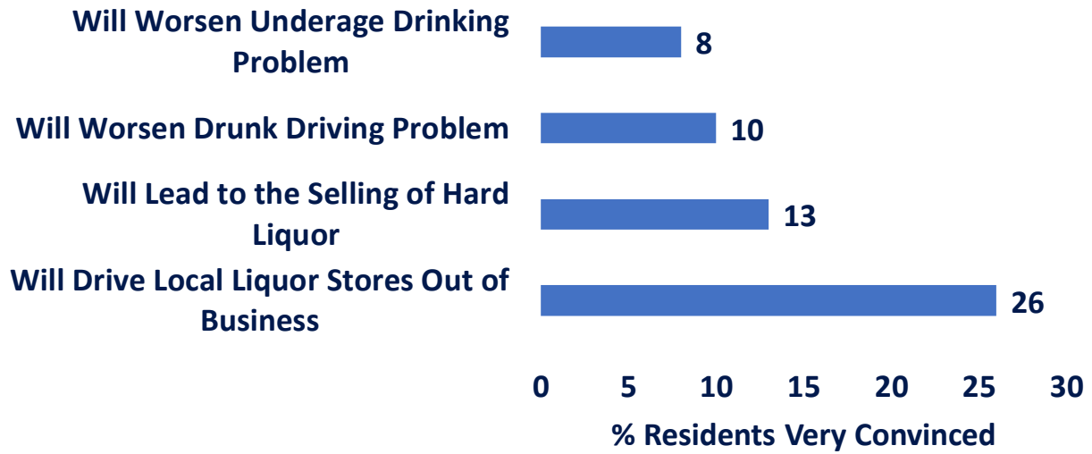
TABLE 3 Opposing Arguments to Selling Wine in Grocery Stores